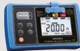
EARTH TESTER FT6031-50