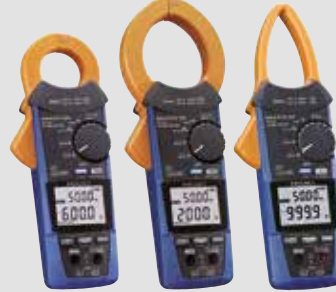
AC/DC CLAMP METER CM4371-50 CM4373-50 CM4375-50