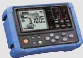
BATTERY TESTER BT3554-50