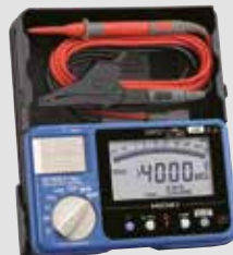
INSULATION TESTER IR4057-50