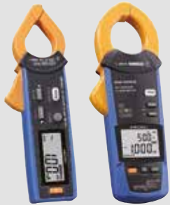
AC LEAKAGE CLAMP METER CM4001, CM4002, CM4003