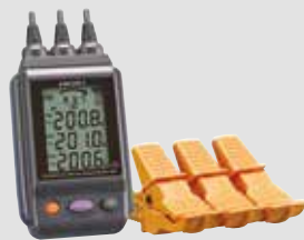
DIGITAL PHASE DETECTOR PD3259-50