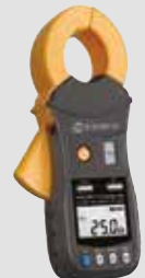
CLAMP ON EARTH TESTER FT6380-50

More compatible HIOKI products and apps are on their way