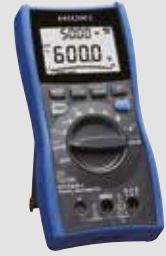
DIGITAL MULTI METER DT4261